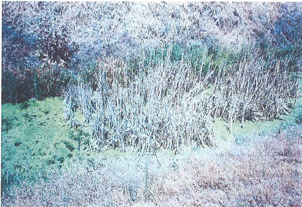
Figure 4. Cattails, duckweed and other vegetation present at surface of water.