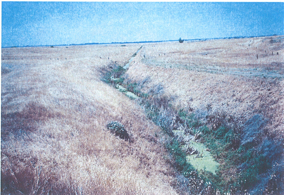
Figure 2. Vegetation present in the drainage downstream of the canal, with property line fence in the background for reference.