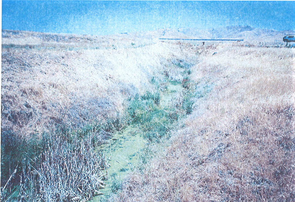
Figure 3. View of drainage from downstream in the direction of the canal.