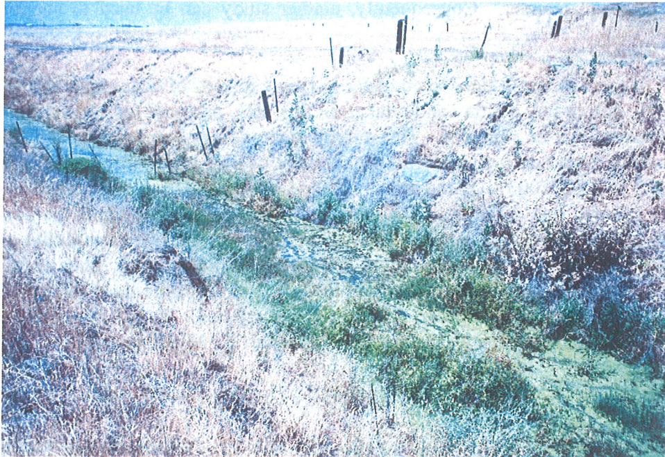
Figure 5. View of water present in drainage with view of duckweed covering portions of the water.