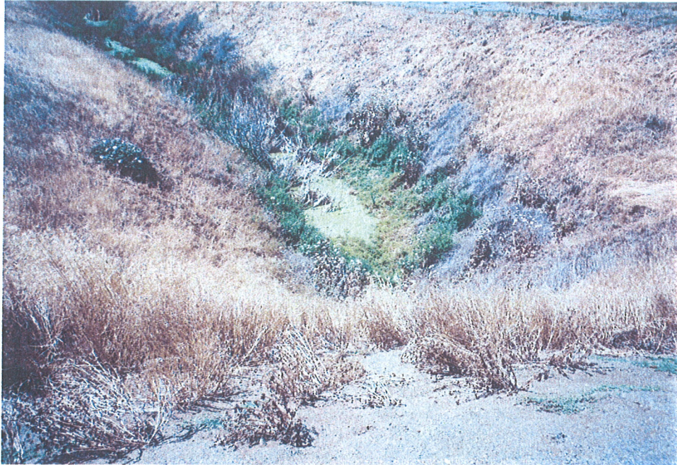
Figure 1. Vegetation present in the drainage downstream of the canal.