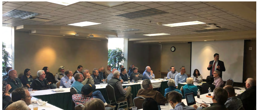
The Bureau of Reclamation held a public meeting on CVPIA 'true up' in Visalia on January 4th