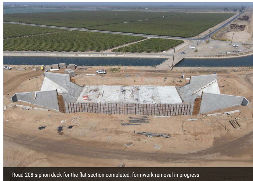
Road 208 siphon deck for the flat section completed; formwork removal in progress