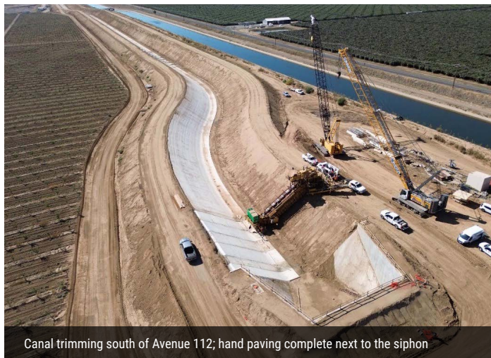
Canal trimming south of Avenue 112; hand paving complete next to the siphon