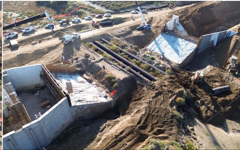
Deer Creek siphon north headwall and south deck section formwork/reinforcement in progress