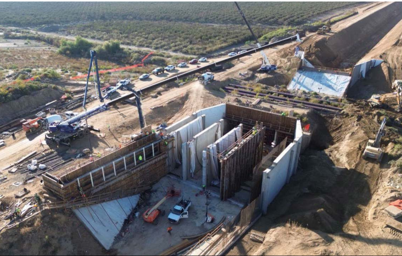
Deer Creek northeast transition and weir wall concrete placements

"FKC Middle Reach Capacity Correction Construction Progress Update" Continued