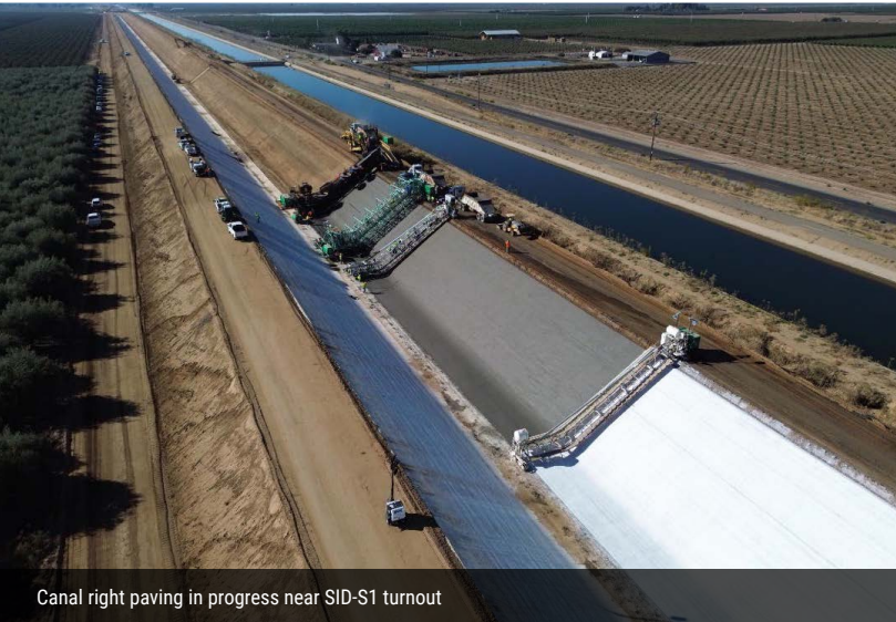
Canal right paving in progress near SID-S1 turnout