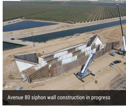
Avenue 80 siphon wall construction in progress

Deer Creek check structure: wall formwork and reinforcing bars installed for check middle walls, siphon deck sections, and transition/weir wall, and six concrete pours were made at those locations. Road 192 siphon: formwork removed. Terra Bella Avenue siphon: formwork and reinforcing bars installed for sloped deck sections and headwalls, and concrete was poured; with the overall concrete structure completed this month (4th siphon to be completed.) Avenue 128 siphon: structural backfill placed and compacted. Road 208 siphon: falsework for the sloping deck section installed. Avenue 88 siphon: no work conducted. Avenue 80 siphon: installed formwork and reinforcing bars for wall and deck sections and poured concrete for wall sections. Turnouts: work conducted at Teapot Dome, SID-S2, SID-S3, SID-S4, Deer Creek Wasteway, and Terra Bella ID included installing formwork, installing reinforcing bars, placing concrete, and placing structural backfill and pipe backfill. Formwork and reinforcing bars were placed at the Terra Bella weir and concrete was poured. Electrical and instrumentation work was conducted at the TBID turnout and Deer Creek. Southern California Electric completed their inspection at Deer Creek.