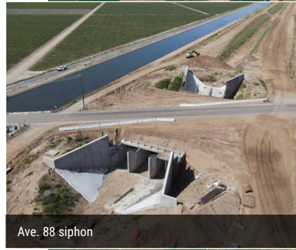
Ave. 88 siphon

Due to severe storms from March, the cleanup efforts continue. At the Deer Creek area, there was re-establishment of the creek crossing, and part of the temporary diversion berm was replaced. Next, canal embankment was placed between Avenue 128 and worked up towards Avenue 112; there was additional canal embankment between Road 192 and Avenue 64 using borrowed material from the nearby property. Specifically, on Road 192, there was work to reinforce rebar placement, installing formwork, and placing structural concrete in several deck and wall sections. At Terra Bella Avenue, the siphon foundation was completed in terms of formwork, water stops, and bulkheads. Other avenues have also completed formwork as evacuation continued. Work has continued at Casa Blanca, Teapot Dome, DCTRA, SID-S2, SID-S3, SID-S4, TBID, and DEID-68 turnouts. More efforts have been made to inspect equipment and make any needed repairs.