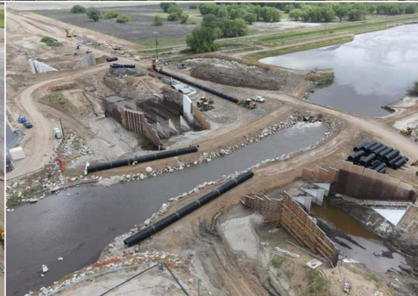
Deer Creek check / siphon cleanup and 60-inch bypass pipe install in progress