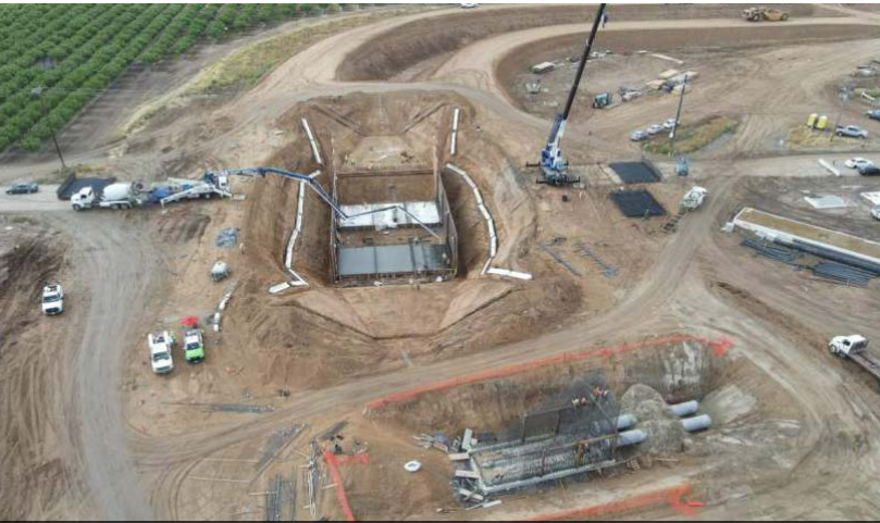
Terra Bella turnout and Ave. 95 siphon concrete slab placement in progress

"FKC Middle Reach Capacity Correction Construction Progress Update" Continued