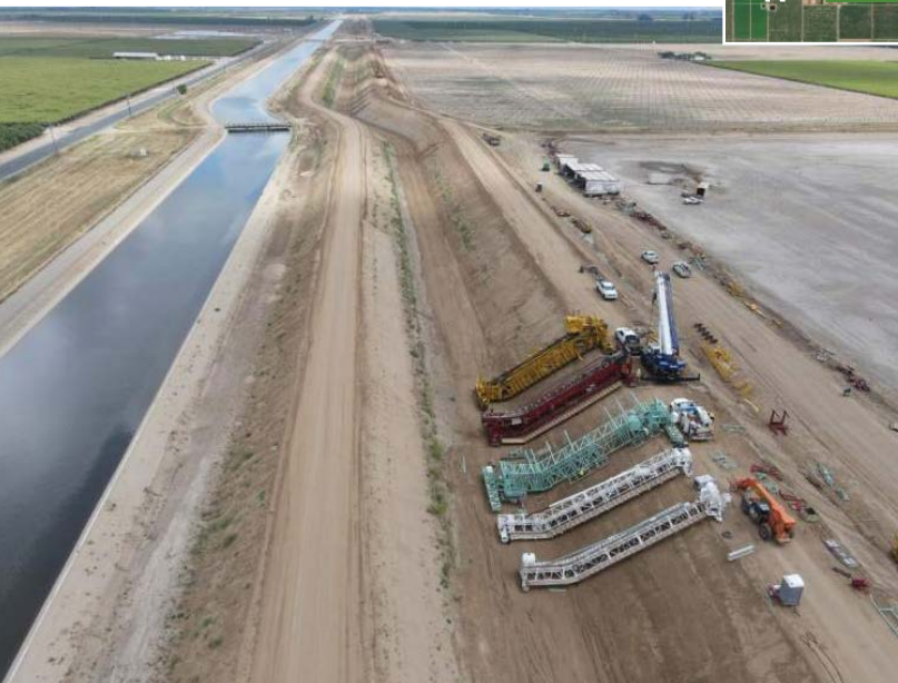
Canal trimming and lining equipment being setup adjacent to TBID borrow area