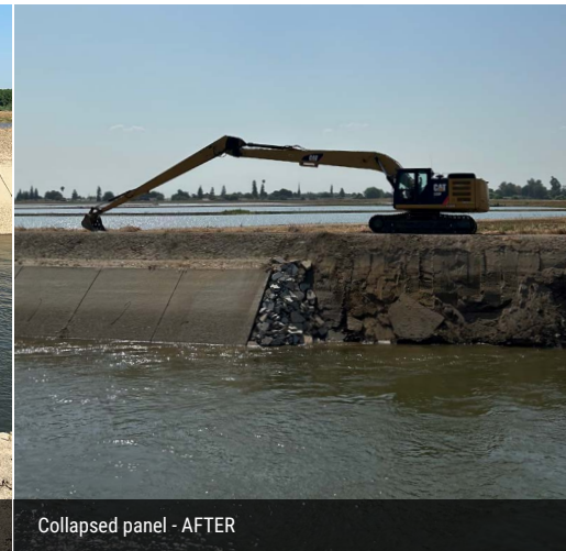
Collapsed panel - AFTER