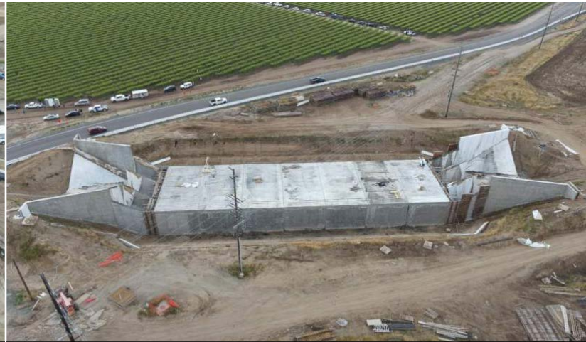
Road 192 siphon - south transition wall complete