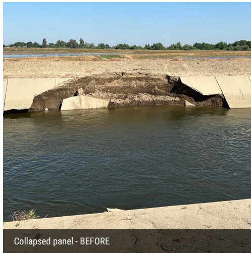
Collapsed panel - BEFORE

Due to several factors, FWA staff observed and immediately began repairing a number of collapsed concrete panels just south of the Tule River. Temporary repairs should be completed before the end of next week. Permanent repairs will be made during the system wide routine de-watering starting in late November 2023.