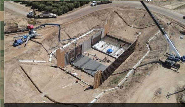
Ave. 128 siphon - invert slab placement