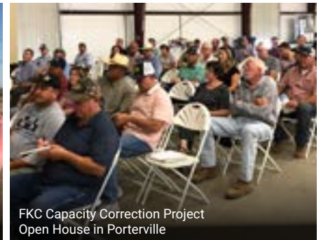
FKC Capacity Correction Project Open House in Porterville