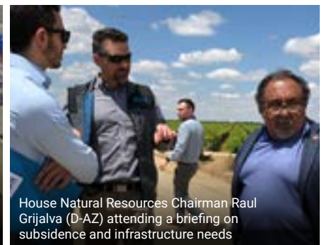
House Natural Resources Chairman Raul Grijalva (D-AZ) attending a briefing on subsidence and infrastructure needs